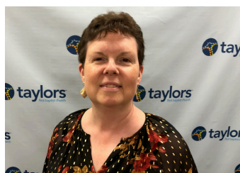
Wendy Williams Joined May 1, 2022 By Statement