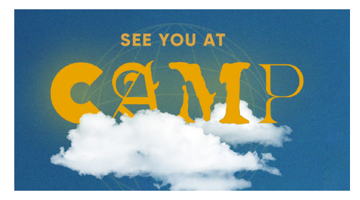
July 17 – 22 North Greenville University Cost: $379 / $100 deposit

Sign up in the Church Center App or at taylorsfbc.org/events.