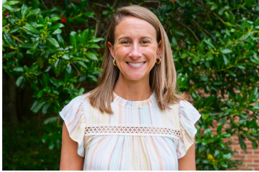
Lea Hardy Minister of Children