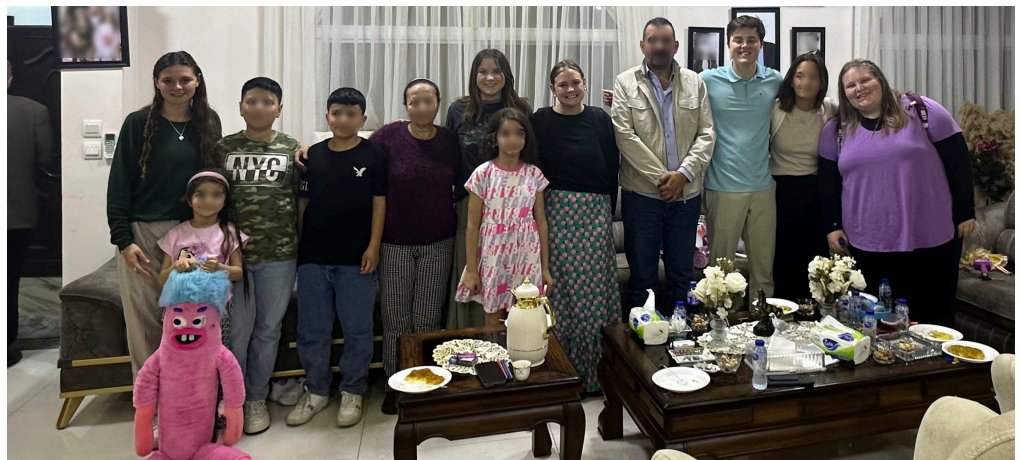
A Christian family who invited the team into their home to share a meal and have gospel conversations. They also showed the team what it is like being a believer in the Middle East.